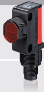
Reflection light scanner - FT28, with fading